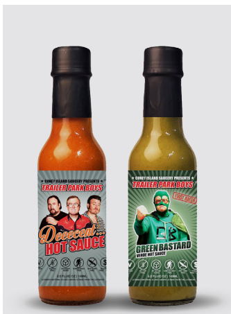
TRAILER PARK BOYS HOT SAUCES