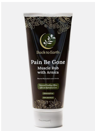
BACK TO EARTH PAIN BE GONE MUSCLE RUB