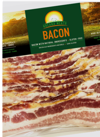
ROCANA THICK SLICE BACON LOCAL