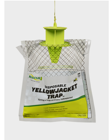
RESCUE DISPOSABLE YELLOWJACKET TRAPS