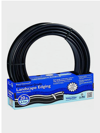
20 FT LANDSCAPING EDGING