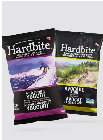
HARDBITE CHIPS BC MADE