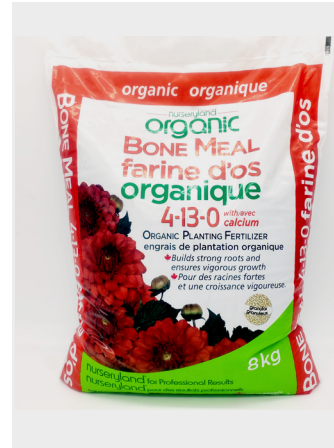
NURSERYLAND 4-13-0 BONE MEAL