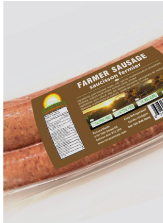
ROCANA FARMER SAUSAGE LOCAL