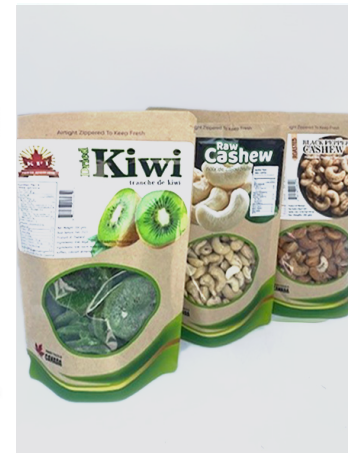
K.F.I. DRIED FRUIT & NUTS SELECTION