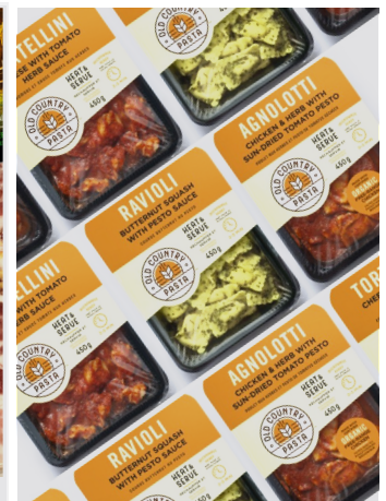
OLD COUNTRY PASTA READY TO HEAT