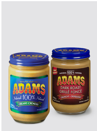
ADAMS ALL NATURAL PEANUT BUTTER - 500G