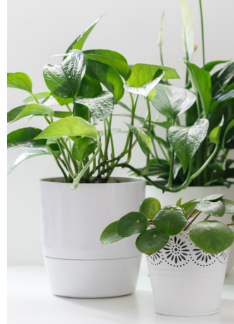
10" TROPICAL PLANTS