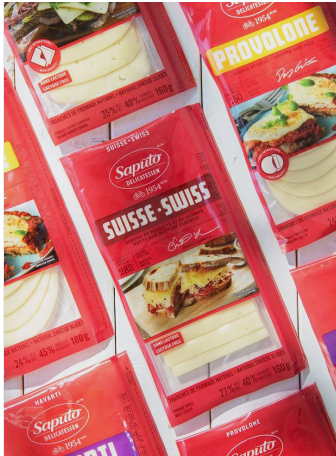
ASSORTED SAPUTO CHEESE SLICES 160-180G