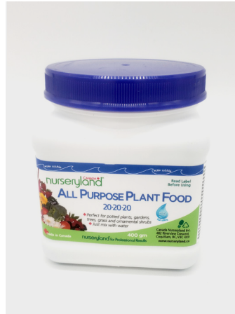
NURSERYLAND WATER SOLUBLE FERTILIZER 20-20-20